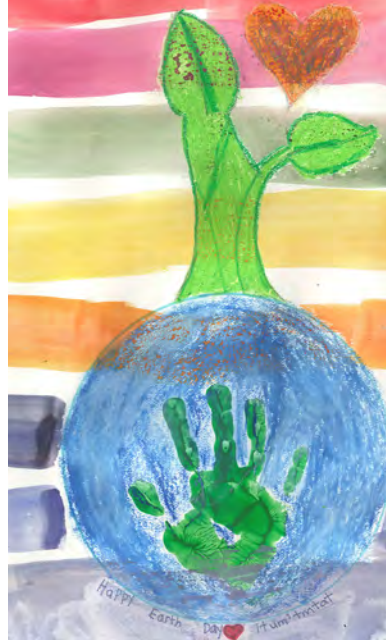
Sen Pok Chin