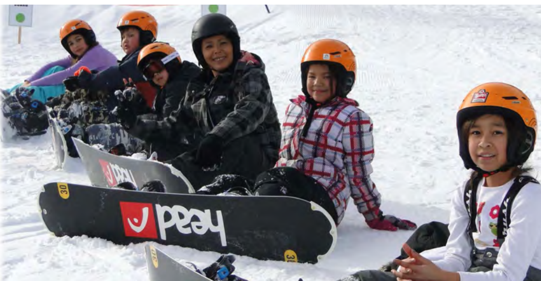
Outma Sqilx’w Cultural School