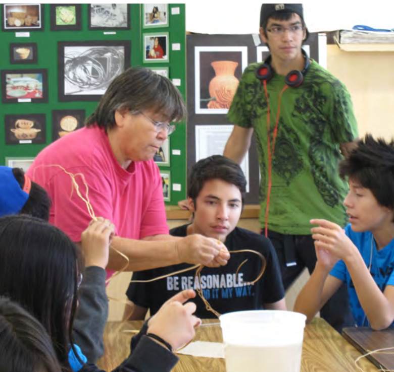
Stein Valley Nlakapamux School

In 2014/2015, FNEC extended its ongoing LEA support activities, including additional information sharing workshops offered in response to requests from First Nations and school districts. In