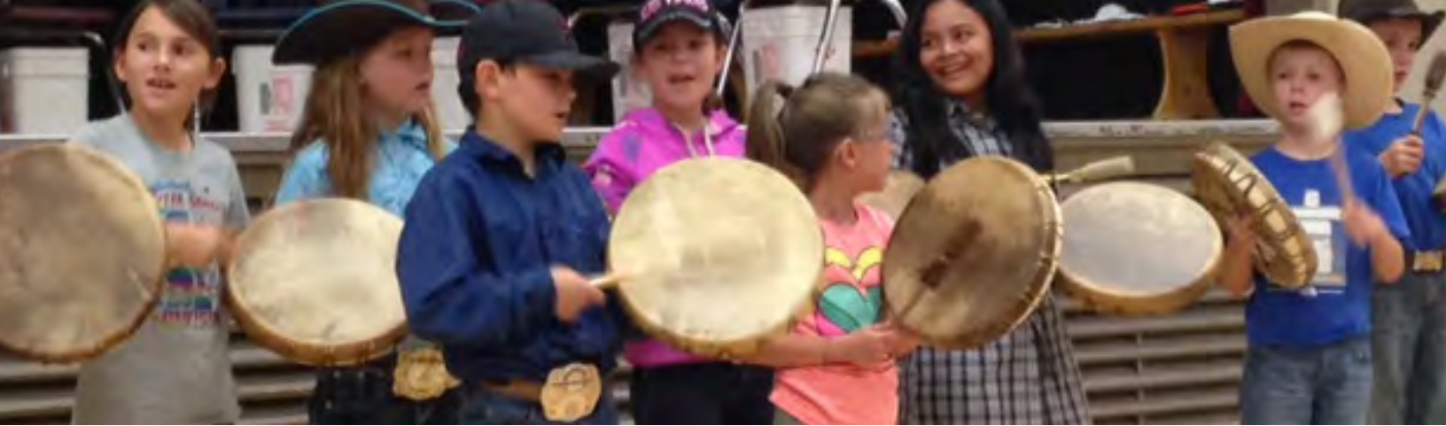
David Stoddart School