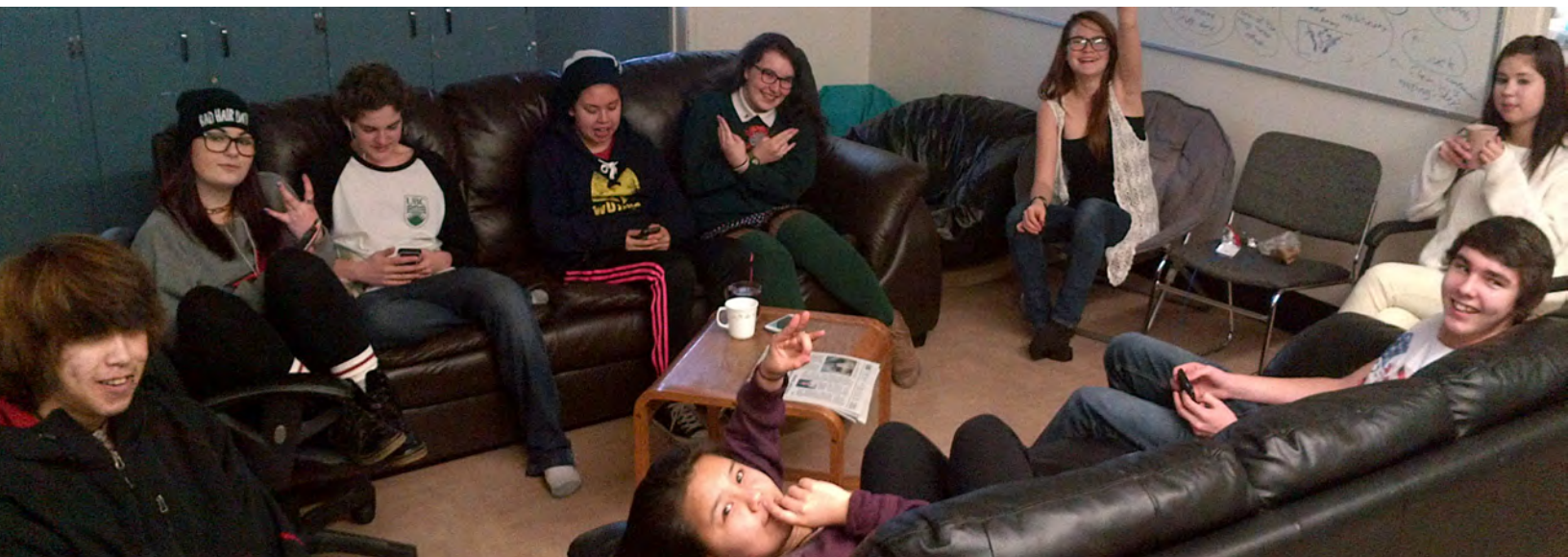
Nala'atsi Aboriginal Education

A sample of the comments shared include: