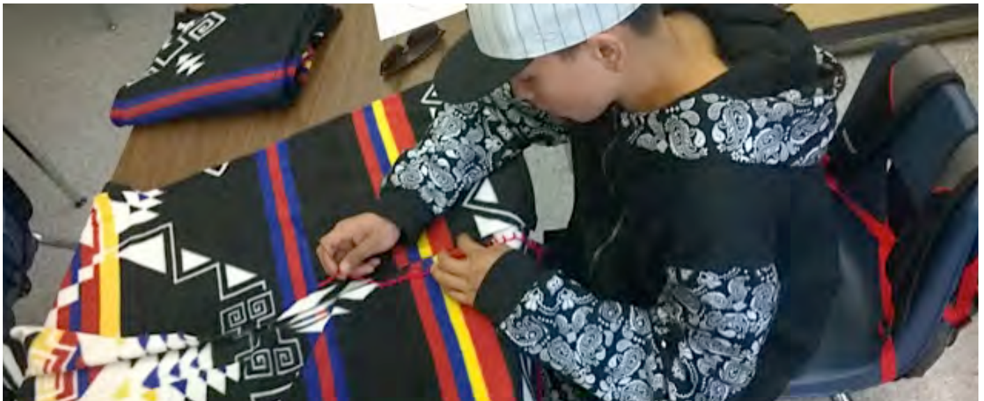
Fraserview Learning Centre