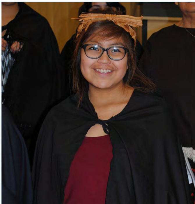
Gold River Secondary School

7224 students in 122 different schools (52 First Nations schools and 70 public schools)