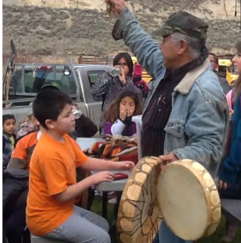
Diamond Vale Elementary

In addition, assistance was provided directly for First Nations that have experienced serious challenges in negotiating a relevant and effective agreement, by undertaking necessary research, collecting data related to the achievement of their specific students, and providing community-based capacity building sessions to help the First Nations prepare for informed LEA discussions, with the intention of advancing agreements in areas that have not experienced success in the past.