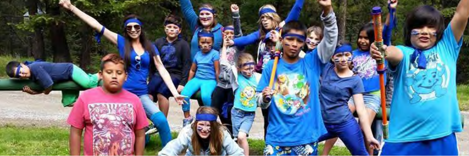
ʔA'q'amnik Elementary Preschool