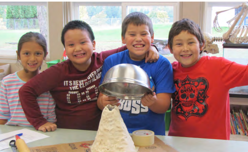
Boston Bar Elementary

More information is available at www.iahla.ca .