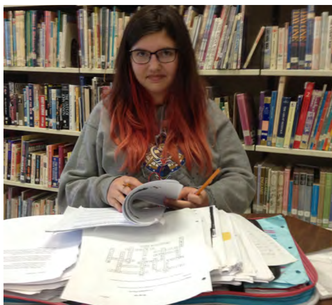
Tumbler Ridge Secondary