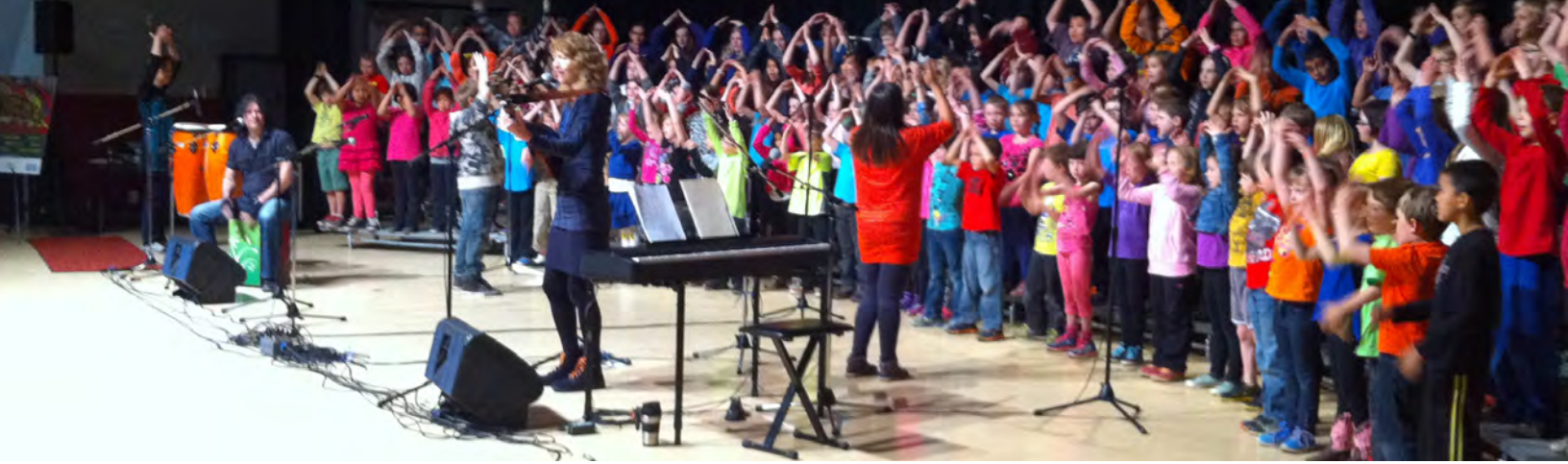
Cataline Elementary School

Through TEFA, FNEC and the Province of BC have reiterated their mutual commitment to increase success for all First Nations students in BC. This commitment recognizes that two thirds of students from First Nations schools transition to public schools, as many First Nations do not have high schools. As envisioned in TEFA, FNEC is an active participant in provincial policy discussions and regular meetings. FNEC and BC also are working together to establish beneficial educational initiatives by sharing resources and expertise, and by extending relevant services and programs between the First Nations and public education systems. This Annual Report highlights numerous examples of this commitment being put into action.