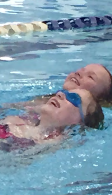
Amy Woodland School