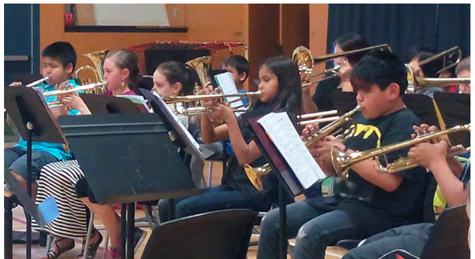
Lalme'eiwesawtexw Parent's Day Tea