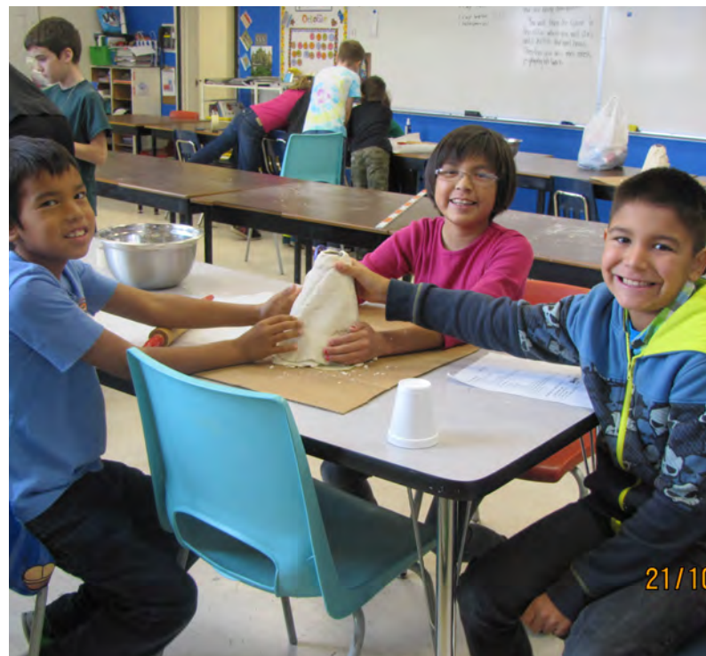
Boston Bar Elementary