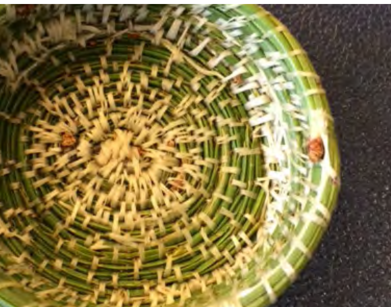
SK'elep School of Excellence

Further, the FNSA supports schools that complete an assessment by providing funding grants in the year following the Assessment Project completion, to sponsor activities identified in School Growth Plans. A team of coaches hired and trained by FNSA and