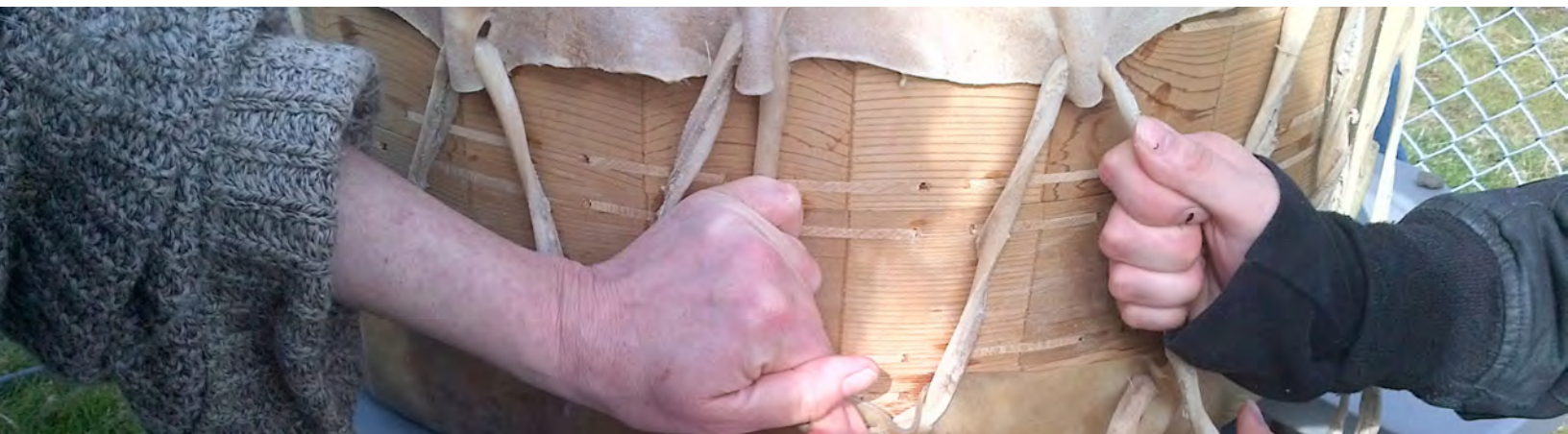
Nala'atsi Aboriginal Education