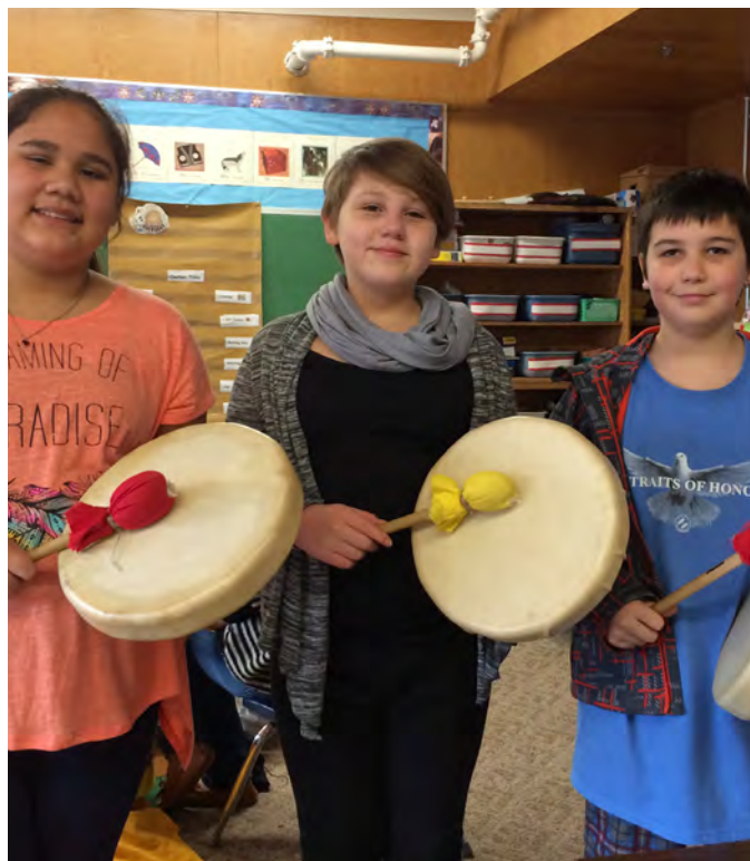
Ecole Puntledge Park