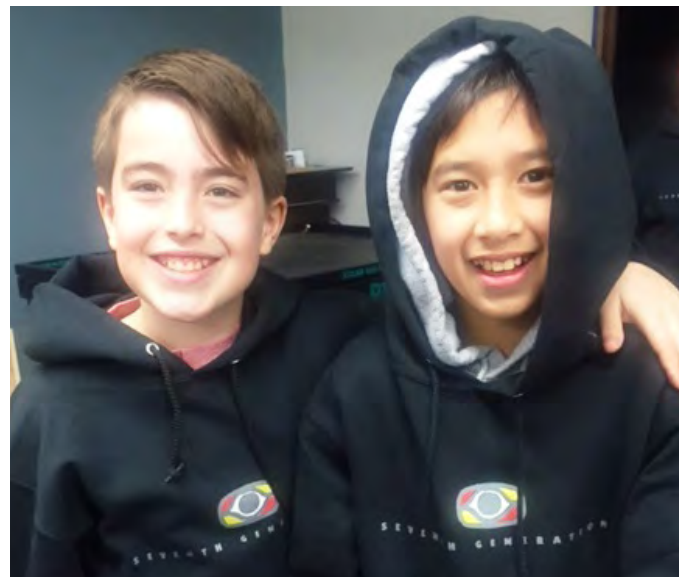
Valley View Elementary

FNEESC and the FNSA also work with individual Education Partners on specific initiatives, as appropriate.