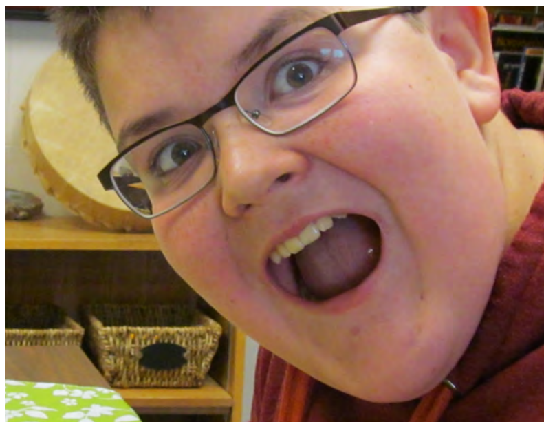
Chief Dan George School